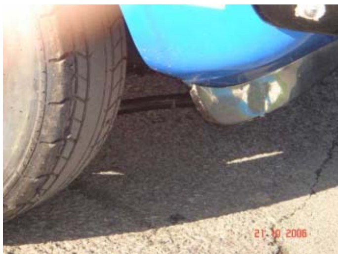
Alan Daffin's Capri was controversial, qualifying with a bib spoiler and plastic rear side windows, neither of which are allowed in Group 1.