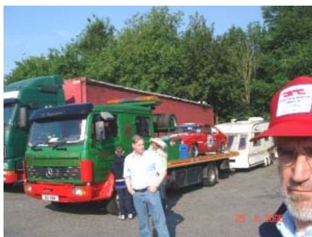
The outfit at Neil's Café on the way down to Dover where P&O weren't impressed by the Truck, Car and Caravan