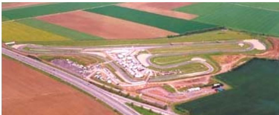
The Croix circuit is about 60 miles from Calais. Built on farmland it packs in a 1.2 mile track and good facilities in a small area.