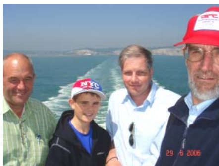
The White Cliffs of Dover recede into the background as Team 76 go International